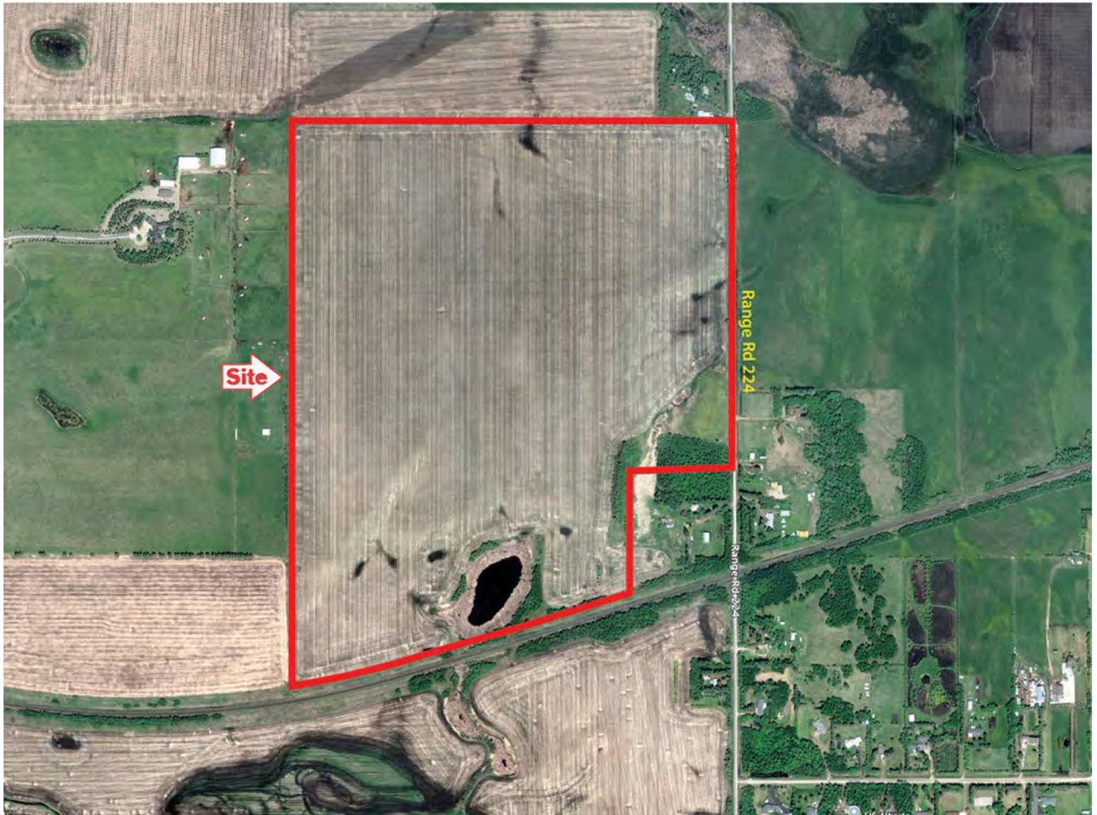
174.7 Acres ... Strathcona County