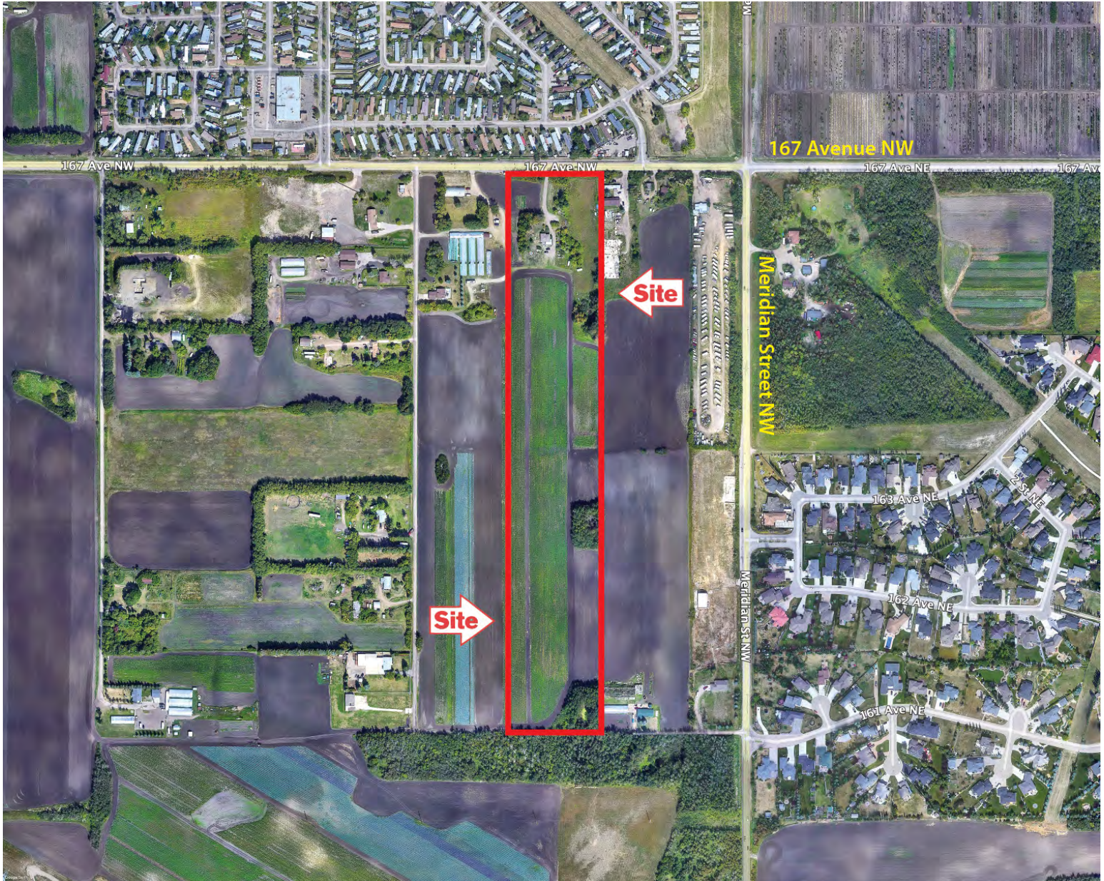
19.71 Acres ... 167th Avenue