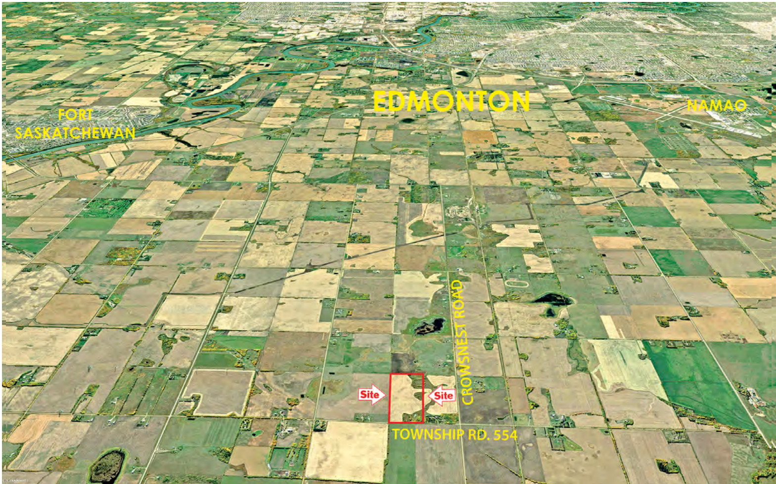
81.57 Acres - Edmonton-Gibbons Corridor